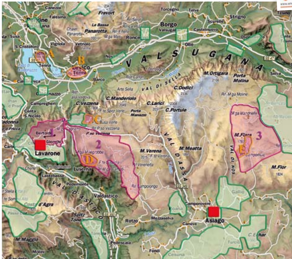
WTOC EMBARGOED AREAS: A-B-C-D-E