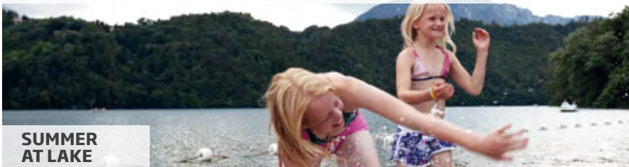
SUMMER AT LAKE

WE OFFER YOU WHAT WE HAVE THE LUCK TO LIVE EVERY DAY: VALSUGANA AND LAGORAI!