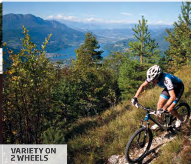
VARIETY ON 2 WHEELS