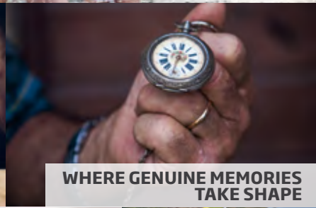
WHERE GENUINE MEMORIES TAKE SHAPE