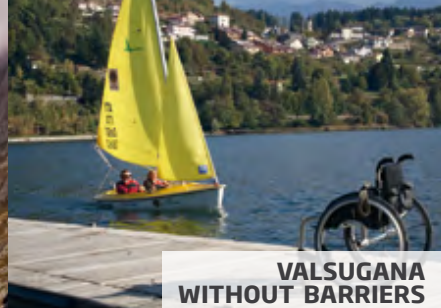
VALSUGANA WITHOUT BARRIERS