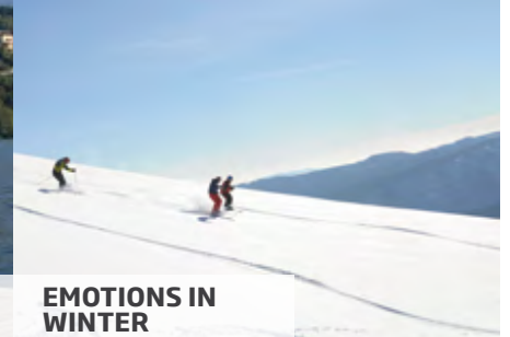
EMOTIONS IN WINTER